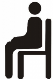
Stay in seat. Face forward and be prepared.