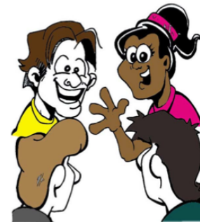
Work in small groups.

A –I should be reading the poster at my station and then answering the questions.