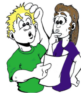
May work with a partner.