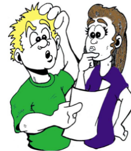
May work with a partner.