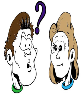
Ask partner for help