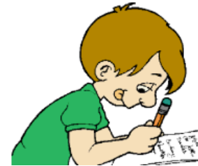
Pay attention and take notes