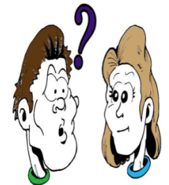
Ask classmate at station for help

H – I should ask someone at my station if I have a question.