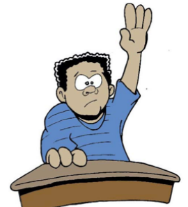
Raise hand to speak or to ask a question.