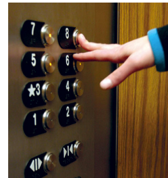
Only ride if you have a pass from the nurse. Make room for others and be respectful.