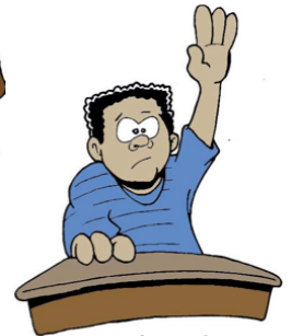
Raise hand to speak or to ask a question.