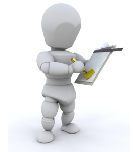
Move from station to station. Work on your assignment.

M – I can move from station to station when the timer goes off.