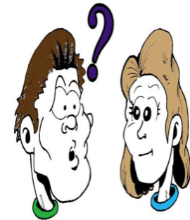
Ask security or a teacher for help